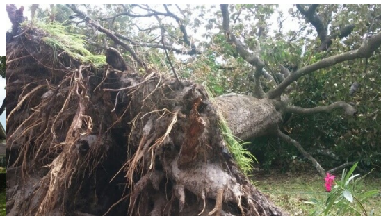
Right: 850 Daytona Avenue, known for its plentiful magnolia trees lost one of the largest and oldest in the area per the opinion of one tree serviceman. Home built circa 1935.