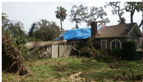
827 Daytona Ave, built in 1939, had a tree fall on its roof.

Below: Daytona Avenue and 9th Street. The historic district area homes had plenty of downed trees..