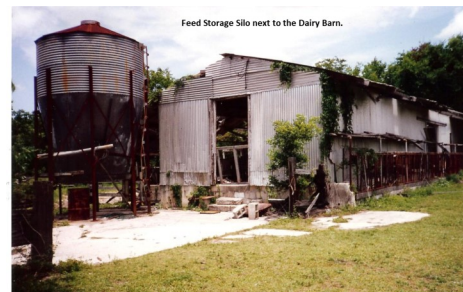
Feed Storage Silo next to the Dairy Barn.