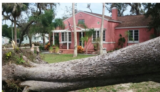
847 Daytona Ave, built in 1946, lost a tree.