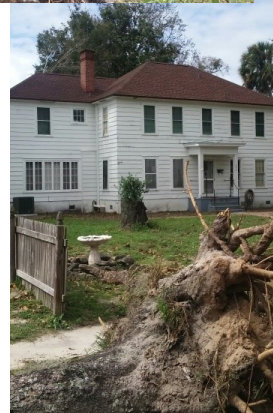
Above: This ancient magnolia tree is a victim of Hurricane Matthew.