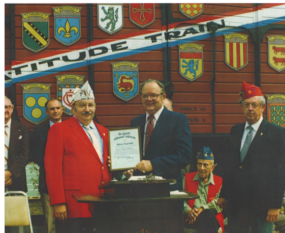
Boxcar dedication to Holly Hill in 1986 at City Hall.