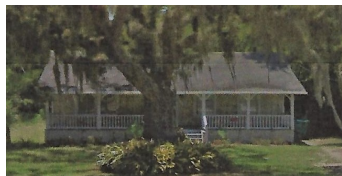
Janoski Cottage built 1920

The 2018 Historic Tour of Homes will be the biggest ever with 17 sites on the list. Three new homes are on the tour this year. Volunteer to help out and purchase your tickets now. There will also be a Seaplane exhibition at Sunrise Park. Bring along a friend or two to enjoy the Tour with you! Remember this is our largest fund raising event for the Museum. Tell everyone about it & how to get tickets! Get your tickets early to plan your route!