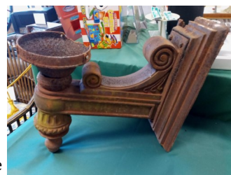
Right: Arch Scone

Thank you to the resident who informed public works about the iron lighting scone that fell off the Calle Grande Arches and could have been lost. It is now safe in the Museum. This will be used to recreate any of the missing ones when the Arches are saved and restored. Call the Museum to help.