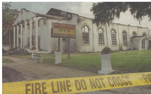
Pedestals shown at Greenland and Church.