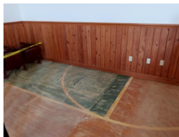
Above: Gym Floor